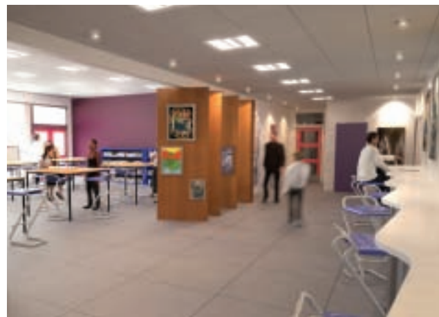
Art & Design Studios