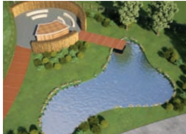
Lake with Gardens