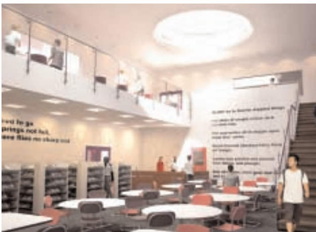
Learning Resource Centre