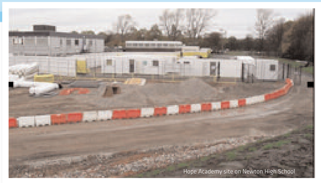
Hope Academy site on Newton High School

Included in those plans are numerous environmentally-friendly features, such as wind turbines, photovoltaics, solar panels and a biomass boiler - following the sponsor's requests that the new Academy should have sustainability at its heart.